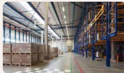
BUILT TO SUIT LAND